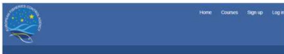
European Fisheries Control Agency e-learning platform

1: O seu e-mail foi autorizado pela AECF para aceder à plataforma. Como passo seguinte, deve aceder ao endereço https://training.efca.europa.eu/ e clicar no link “Forgotten your username or password?” para criar a sua própria “password” (“palavra-passe”).